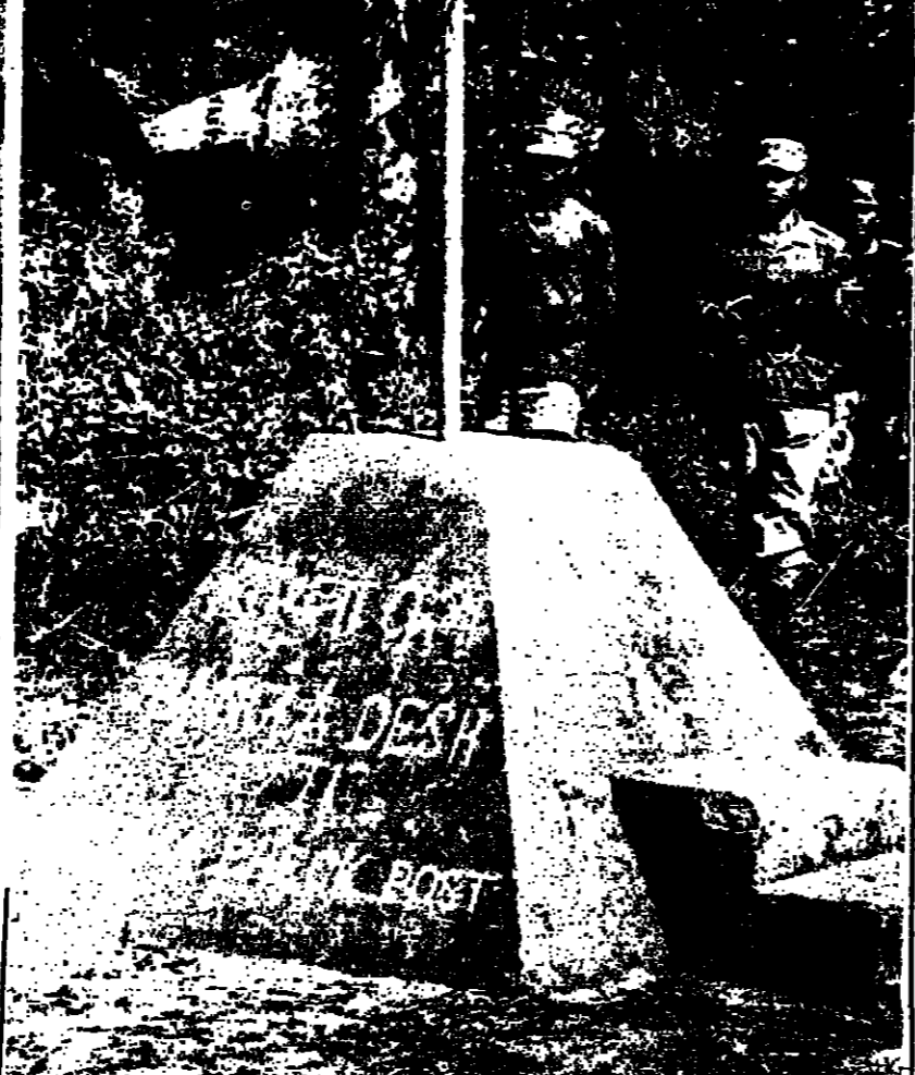
Concrete blocks mark the border check post at the newest frontier in the world — that between Bangla Desh and India. The post is at Belonia, near Feni, an important railway depot and agricultural area.